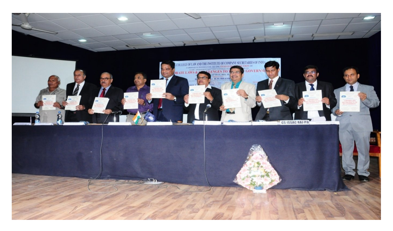
Justice R Subash Reddy, Judge High Court of Judicature at Hyderabad inaugurated sovenir on the occasion on Two Day National Seminar on 'Corporate Laws & Challenges to New Governemts