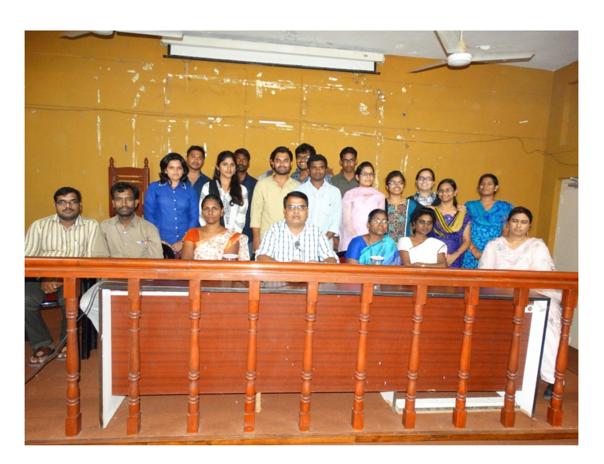
Principal and Teaching staff with elected members of Student Bar Association, PGCL