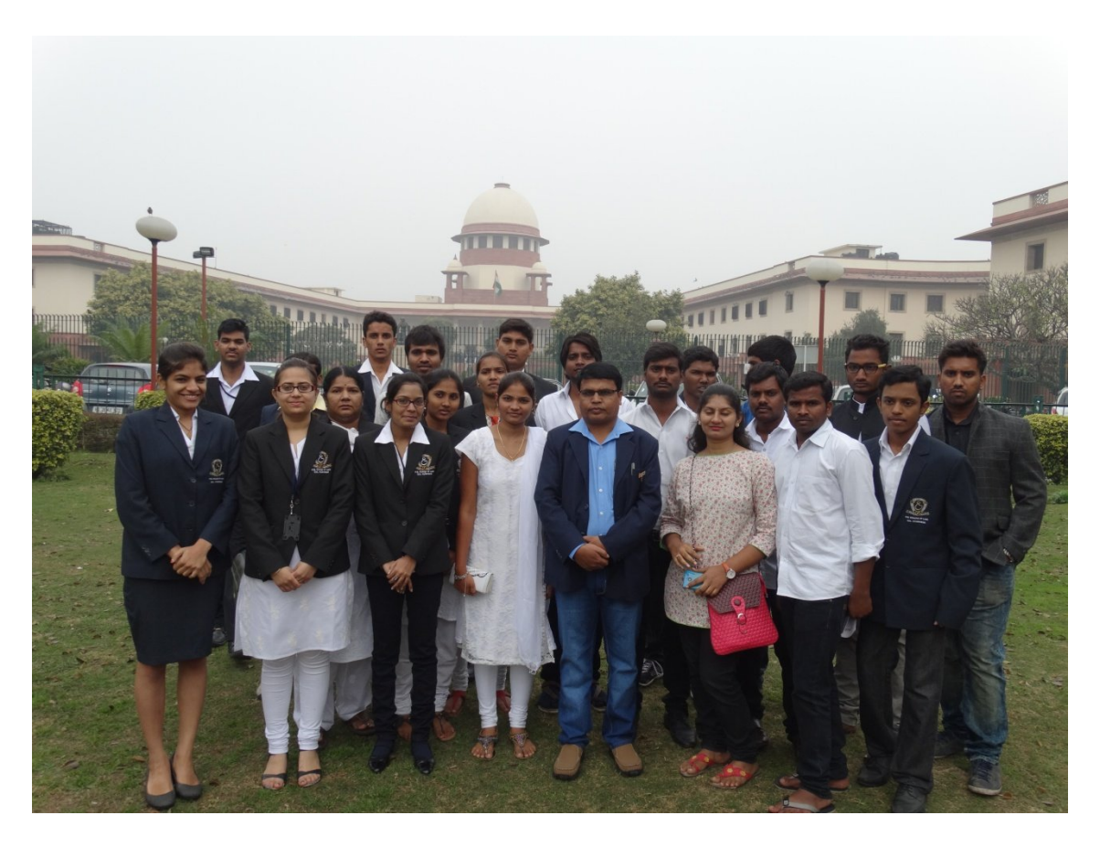
Students of PG College of Law on study tour to Supreme Court of India