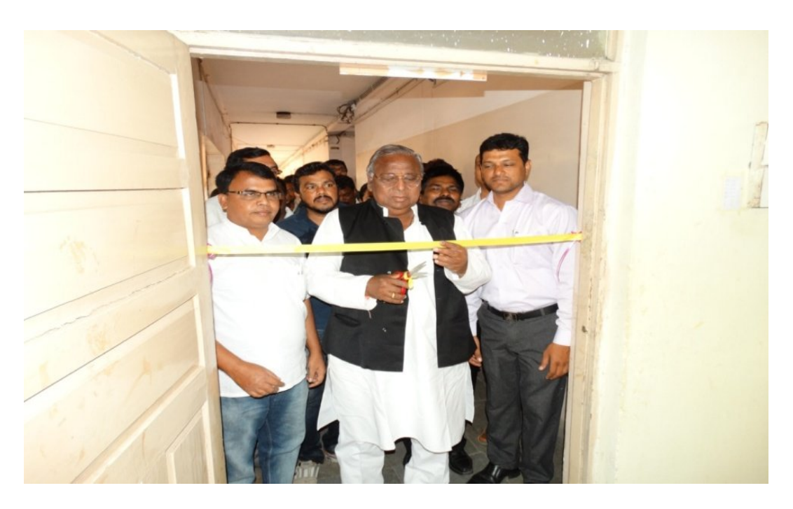
R O Water Plant inauguration by V.HanumanthRao, MP RajyaSabha