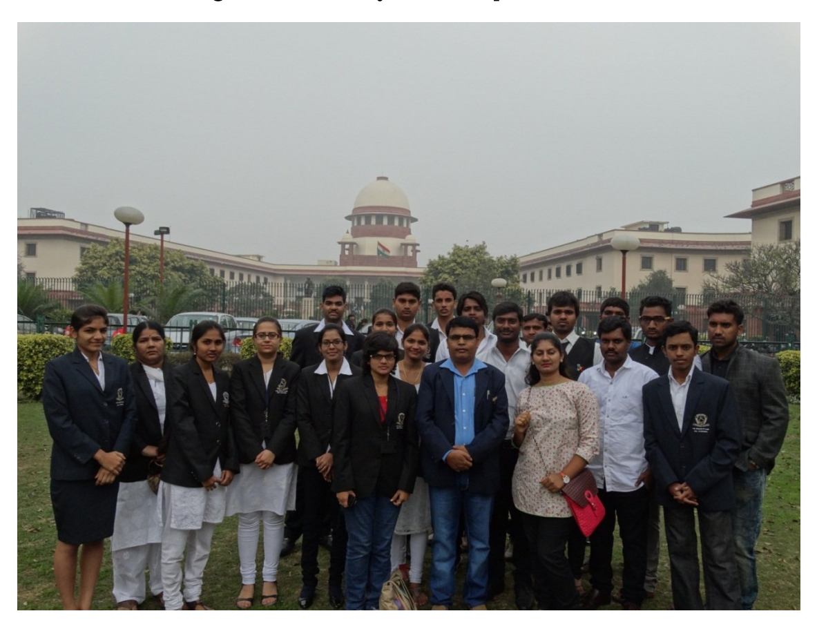
Students of PG College of Law on study tour to Supreme Court of India