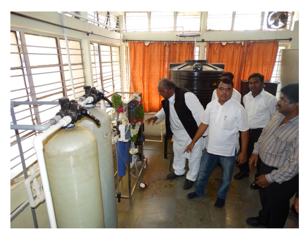
R O Water Plant inauguration by V.HanumanthRao, MP RajyaSabha