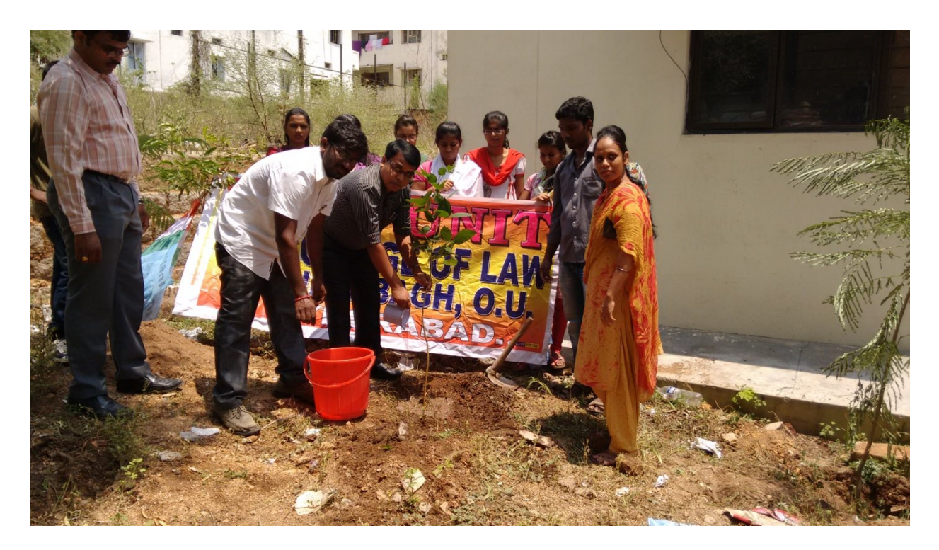
Principal participated in tree plantation programme on the occasion of swach PGCL programme