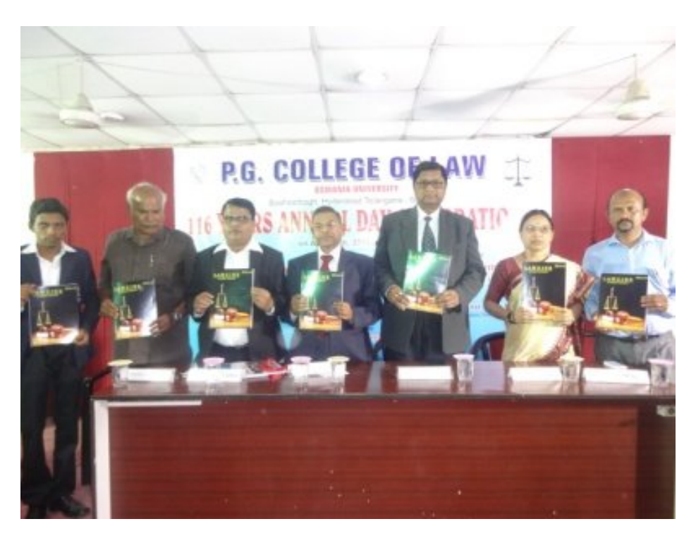
Justice G.Chandraiah, Judge, High Court of Judicature at Hyderabad inaugurating LAWZINE magazine on the occasion of 116th annual day celebration