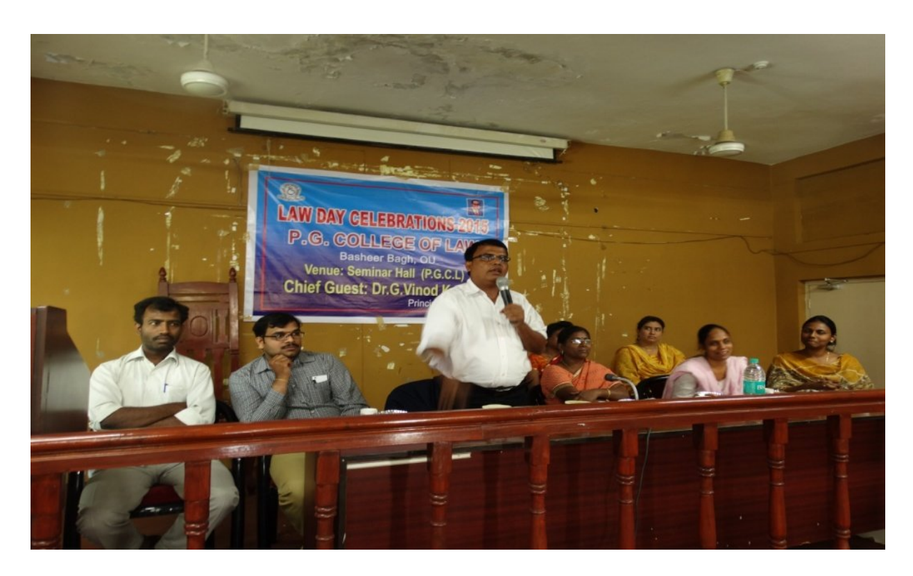
Principal Addressing the gathering on the eve of Law Day Celebrations.