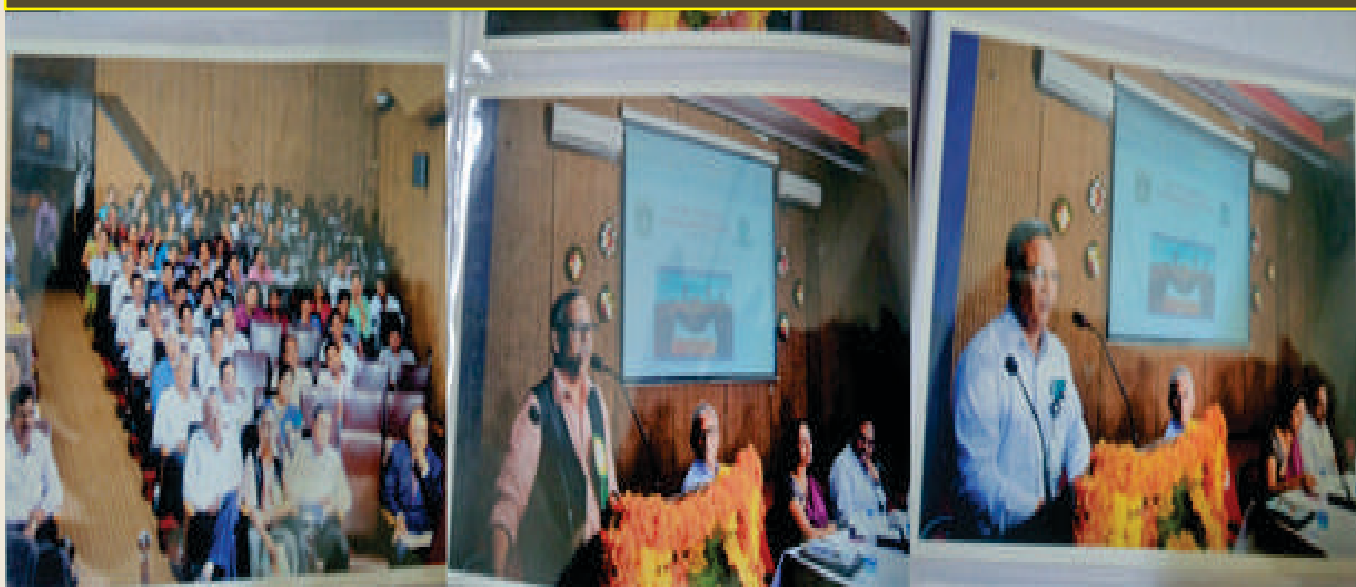
One day Seminar on "Advances in Chemical Science"