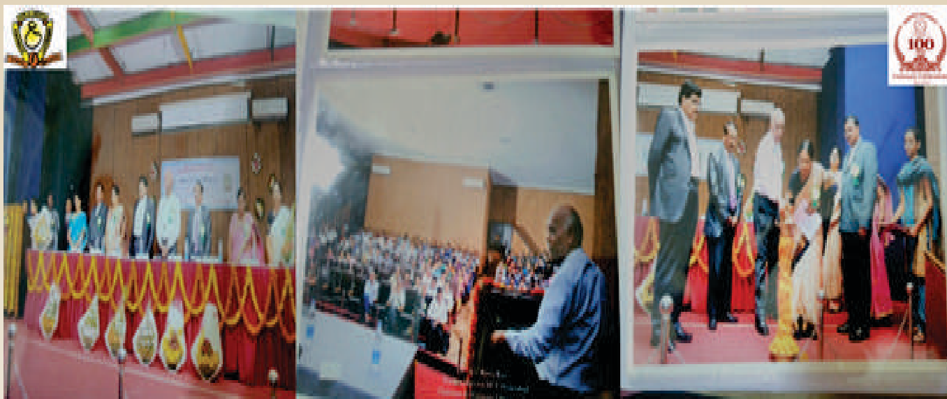
"Academia Industry - Interface" on 6 th August 2014 in Collaboration with RDCC, OU