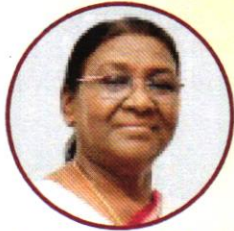
Smt. Droupadi Murmu Hon'ble President of India