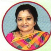
Dr. (Smt.) TAMILISAI SOUNRARAJAN Governor of Telangana & Lt. Governor of Puducherry