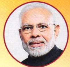
Shri Narendra Modi Hon'ble Prime Minister of India