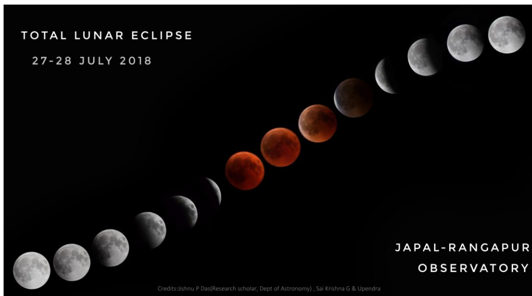
Image taken during Astrophotography session at JRO in 2018 foundation course.