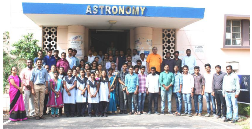
Group picture of Foundation Course 2018