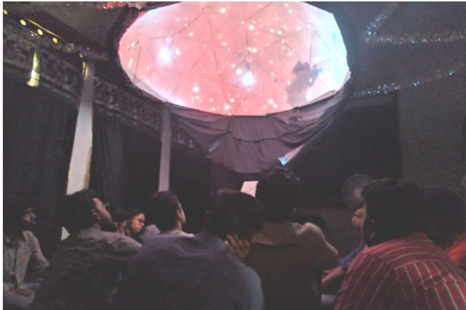
Practical sessions (mini planetarium)2018