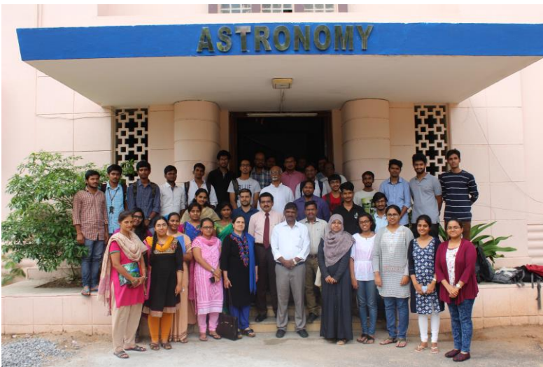
Group picture of 2017 Foundation course