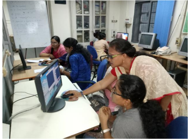
Lab session in progress during 2017 Foundation course