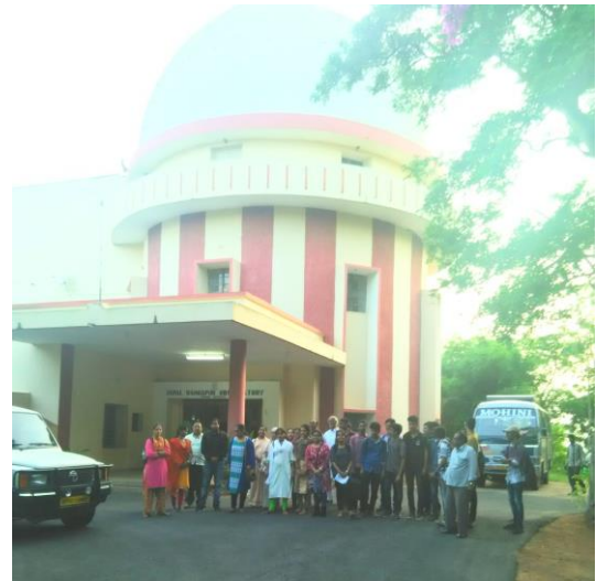
JRO trip 2017 Foundation course.